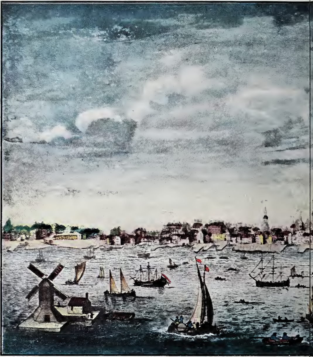
Harbor of Philadelphia, seen from New Jersey (From Etching in The Historical Atlas)