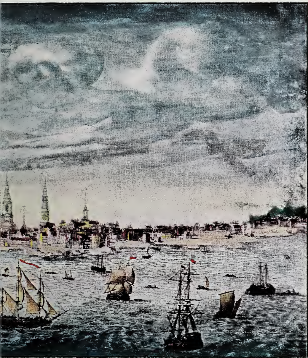
Philadelphia Harbor, based on Scull's Map of 1754 (Philadelphia Historical Society of Pennsylvania)